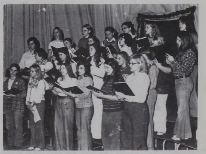
The female section of the concert choir is pictured practicing for the concert they presented Sunday night.