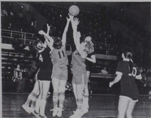
JUMP IT UP! JUMP IT UP! WAY UP THERE!

The G-Men will get in practice for their remaining two regionals by playing in a tournament in Morgantown this weekend.