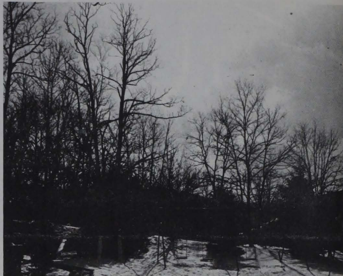
A SUDDEN BURST of sunshine casts shadows of the trees on the snow in front of Clark Hall.

Call for Alternatives to Abortion A Counseling and Referral Agency 6:00 to 9:00 p.m. Monday, Wednesday, Friday Parkersburg-1-428-7422