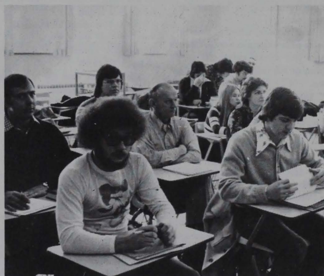
DILIGENT ED. 490 STUDENTS are pictured here in a classroom situation. Today is the final day on campus for these students. Student teacher field assignments are due to commence Monday.