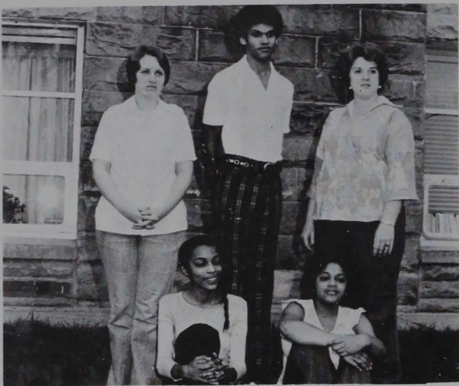
The L-A Bound Forensics Team poses for a pic after their latest tournament triumphs.