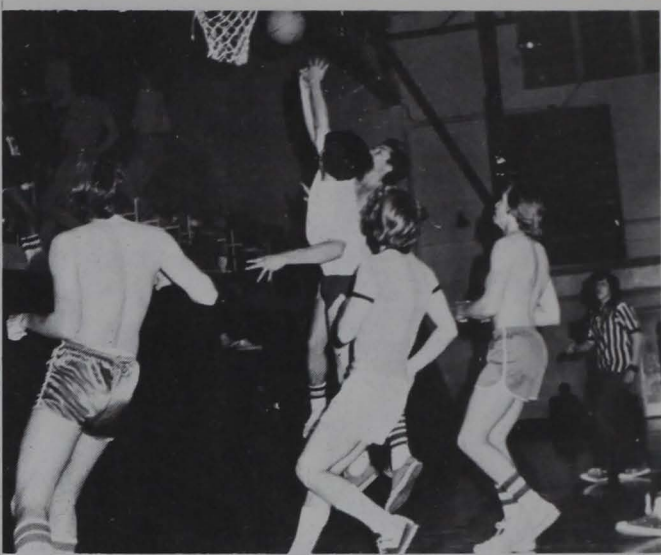
IS IT A GOOD BLOCK OR A FOUL? BE THE JUDGE.