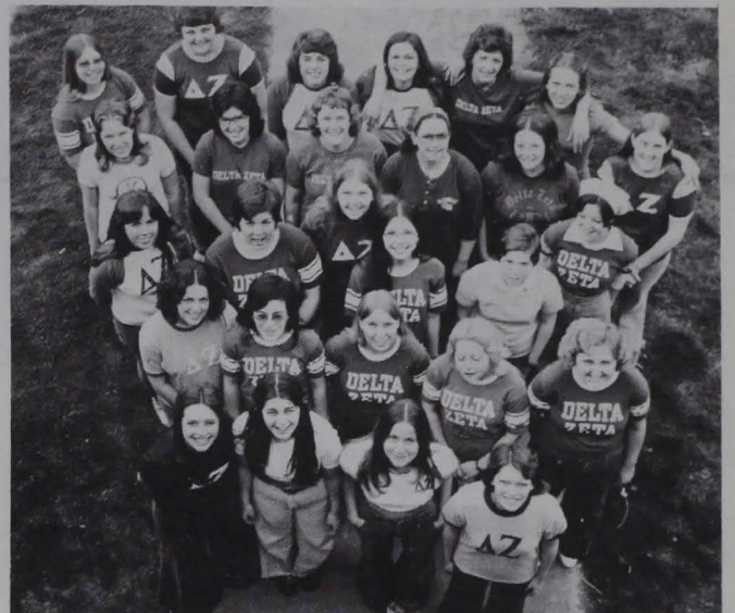
The Theta Xi Chapter of Delta Zeta anxiously anticipates the arrival of over 250 sisters and guests who will be in Glenville for State Day or Saturday.