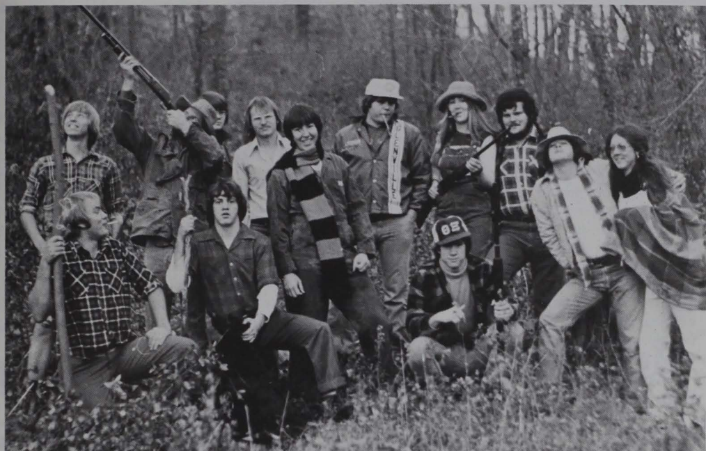
Well folks, it's that time of year for squirrel hunting as well as husband hunting because next Saturday is Sadie Hawkins Day.