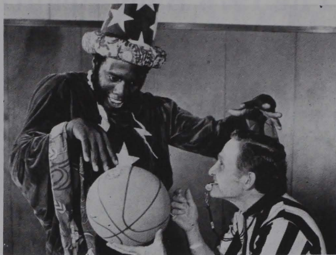
Shown above is one of the Harlem Wizards showing off part of the act that his team will bring to the GSC gymnasium tonight at 8:00.

My last week of predictions proved to be my worst as I hit an only four of nine picks. Looking back on the season I would have to say that it was not a good one for this crystal ball gazer. My season record was 46-30 for a shameful percentage of .615. I'll do better next year . . . I would like to try my hand at one more game before hanging up the tea leaves; Shepherd-13, Concord - 9.