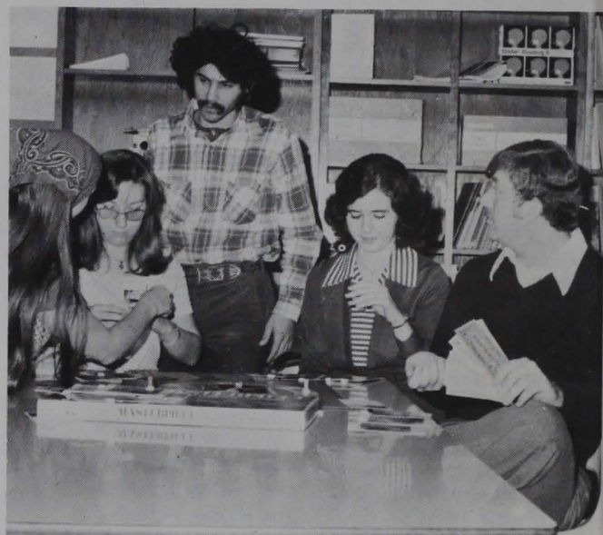
Pictured above are members of Student Education Association discussing plans for the upcoming, Carnival of Games which is scheduled for Nov. 16th.

While there, the representatives attended meetings and saw The Royal Family , a play by George S. Kaufman and Edna Fuber on Thursday night. On Friday they attended a performance by Carlos Montoya, the world renowned Flamenco Guitarist.