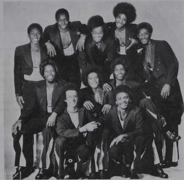
"High Voltage" a group contracted by the Activities Committee of the Student Congress, will be playing in the ballroom Friday night from 9 p.m. to 12 p.m. It will be a dance and concert and admission will be by I.D.