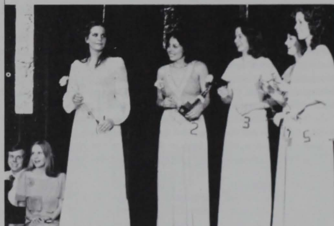
The contestants wait expectantly as Miss West Virginia 1976 prepares to name Miss GSC 1977.