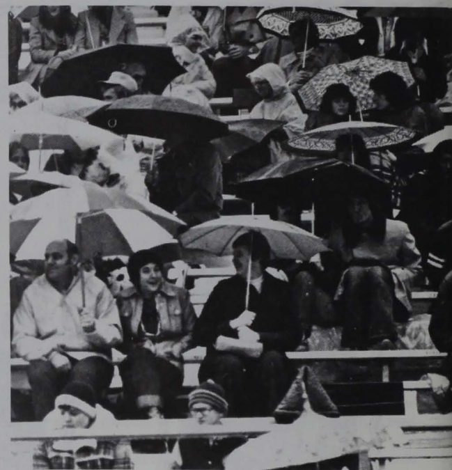
And through it all they sat...