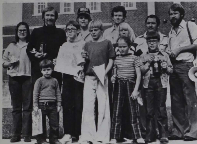
WINNERS OF GSC'S GREAT AIRPLANE CONTEST