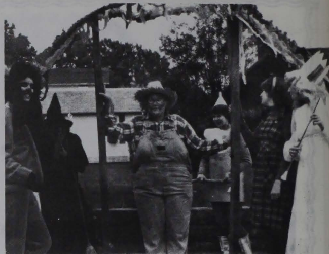
Pickens Hall's third place float