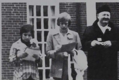
The Honorary float Judges