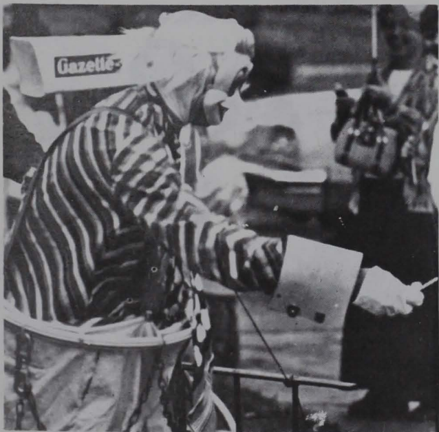
Everyone's favorite—The Clown