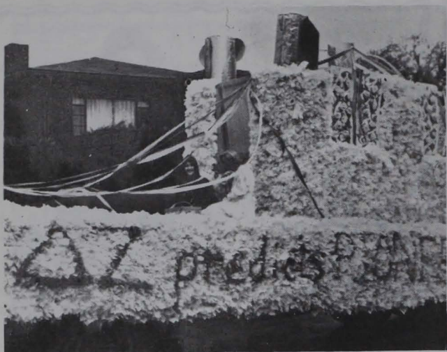
DZs Predict a Pioneer Victory on their second place float