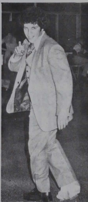
It's easier on one foot.