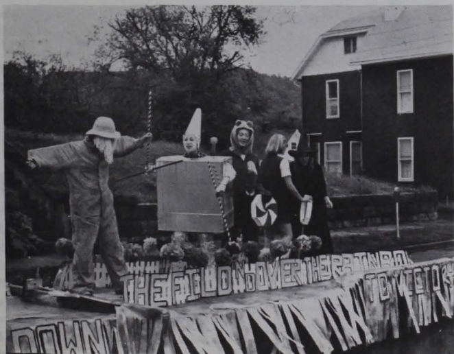
First place float in the 1977 Homecoming Parade was entered by the Sigma Sigma Sigma sorority.