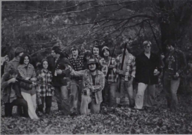
Sadie Hawkins is coming and the whole dern gang is getting ready for next Saturday's celebration!