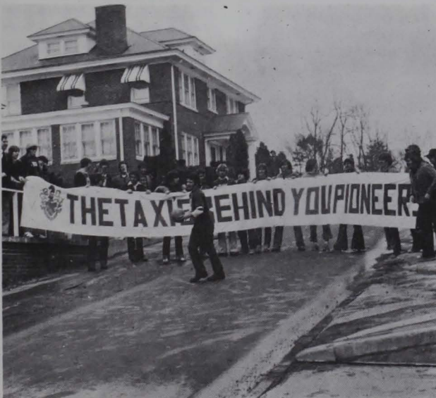
The Theta Xis are pictured as they began their long trek to Charleston on Tuesday.