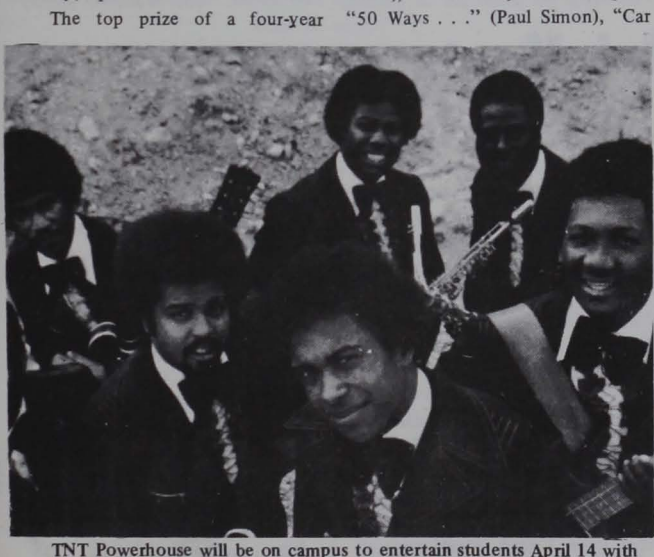
TNT Powerhouse will be on campus to entertain students April 14 with music at a Student Congress sponsored dance.

Thursday, April 13, 1978, 4:00 p.m., 102 Clark Hall, there will be a meeting for all Students who plan to student teach first or second semester