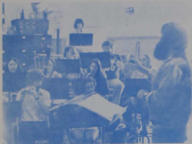
The GSC Wind Ensemble prepares for their upcoming concert to be Thursday evening.