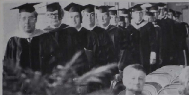
Stoic and majestic in their academic regalia, the Inaugural Convocation Processional began on Friday, April 28.

"The present contains nothing more than the past, and what is found in the effect was already in the cause."