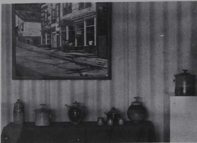
Art work from the Faculty Art Show is indicative of talent and skill. Note the local 'Country Store' in the picture.