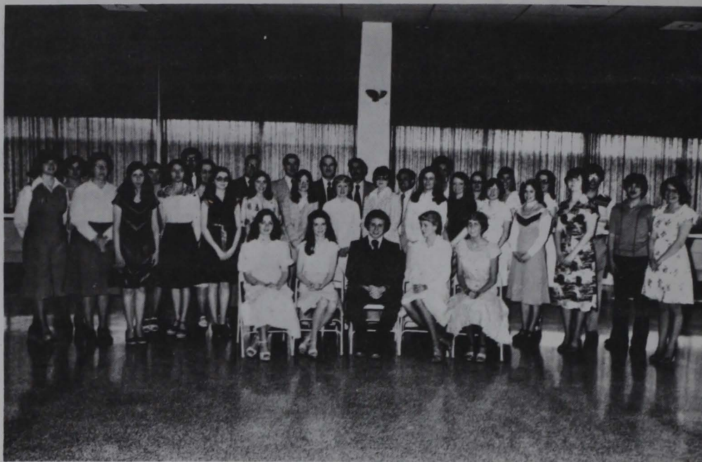
Members of Kappa Delta Pi, education honorary held a formal banquet prior to the initiation of their new members. Also in attendance were guest speakers, advisors, and guests.