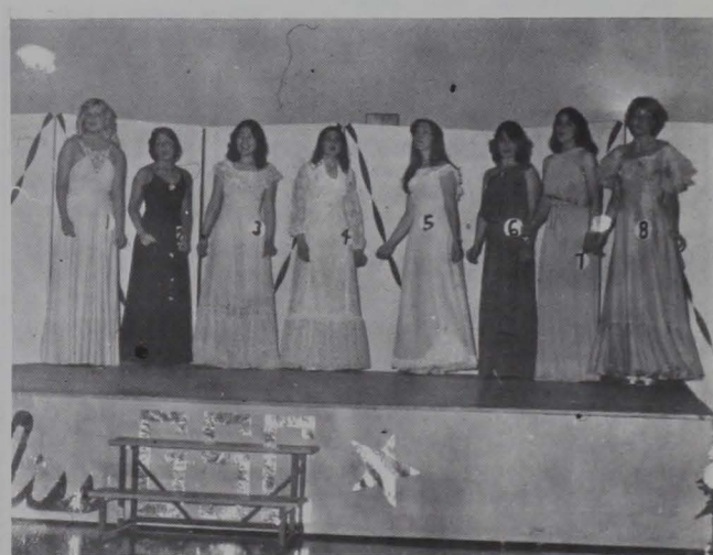
Miss GSC contestants "stepping out" in their evening gowns during the pageant.