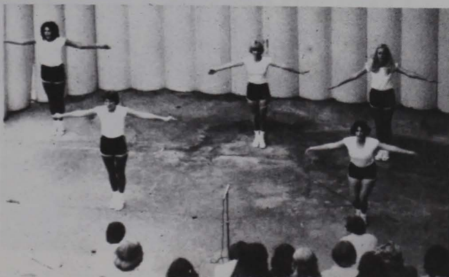
Cheerleaders performing at freshman pep rally.