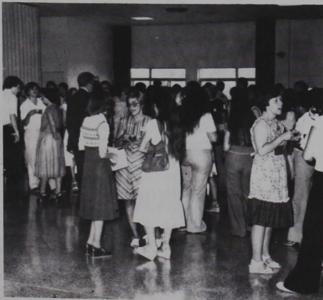
Incoming Freshmen mingle with GSC Faculty and staff at the Freshman Reception.