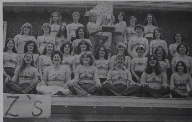
The Delta Zeta's proudly display the Outstanding Chapter in the State award, one of the 16 awards they received at the annual State Day held at Fairmont.

The sisters are having a Thanksgiving Dinner for their big brothers on Wednesday, Nov. 15 at 5:00. All big brothers are urged to attend. There will be a standards meeting on Sunday from 6-9 p.m. All DZ are required to attend.