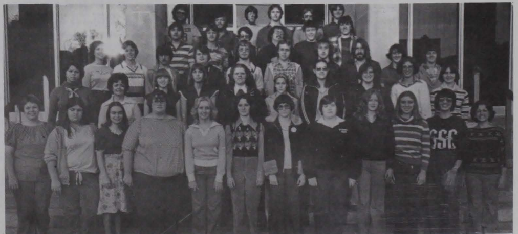
GLENVILLE STATE COLLEGE CHOIR