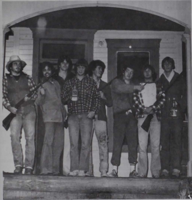
The Family Picture of the Sadie Hawkins Day 'Dogpatch' Crew.

Tickets for SEND ME NO FLOWERS are available in the little red school house information center and will be available at the door.