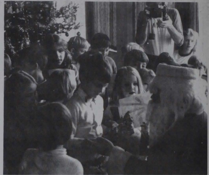
Tanner Elementary students are seen greatly enjoying their Christmas party given by the Lambda Chi fraternity and talking to Santa Claus.

A smoker will be held on January 31. All Ladies please plan to help out.