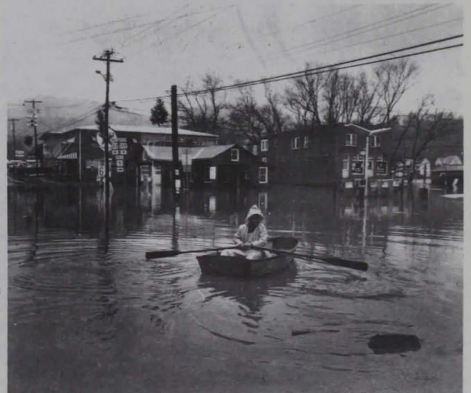
THE ONLY WAY TO TRAVEL. The large rain fall last week-end caused approximately six feet of water to invade the streets of downtown Glenville.