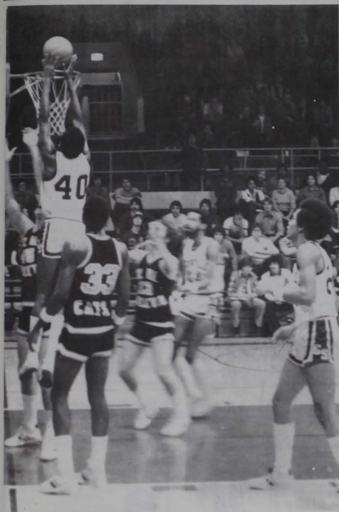
No Folks, this one didn't go in. Too far out, I guess.