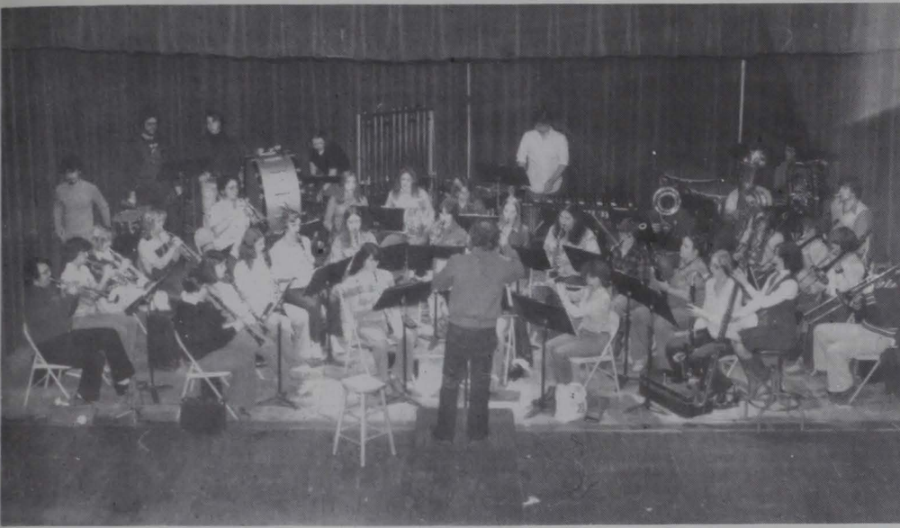
GSC concert band to perform annual Christmas program Dec. 17 at 8 p.m. in the auditorium.