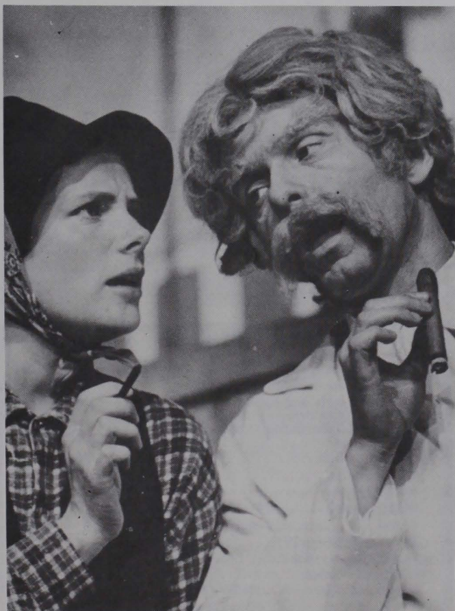
"Well, the point is, my dear..." A scene from "Mark Twain Sketches."