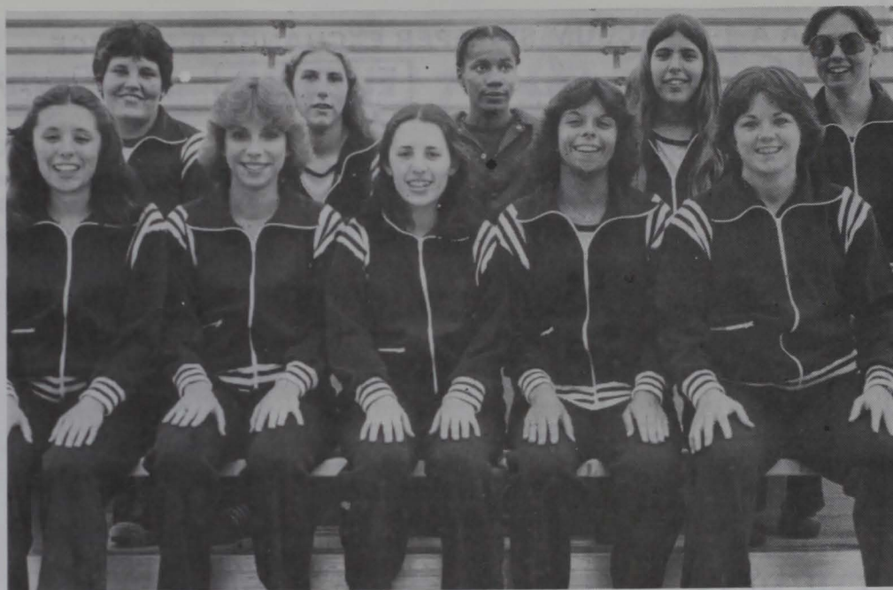
Lady Pioneer Track Team.