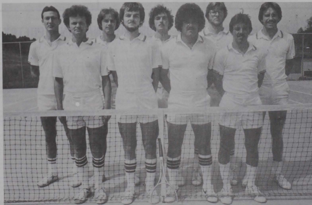
GSC Tennis Team.