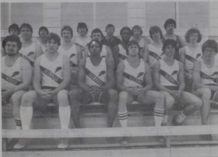
Congratulations to the Men's track team on a fine year.

The football team is working out in full equipment all week with the climax of the practice session coming on Saturday afternoon with the annual blue/white intersquad scrimmage game. All supporters of GSC are urged to attend.