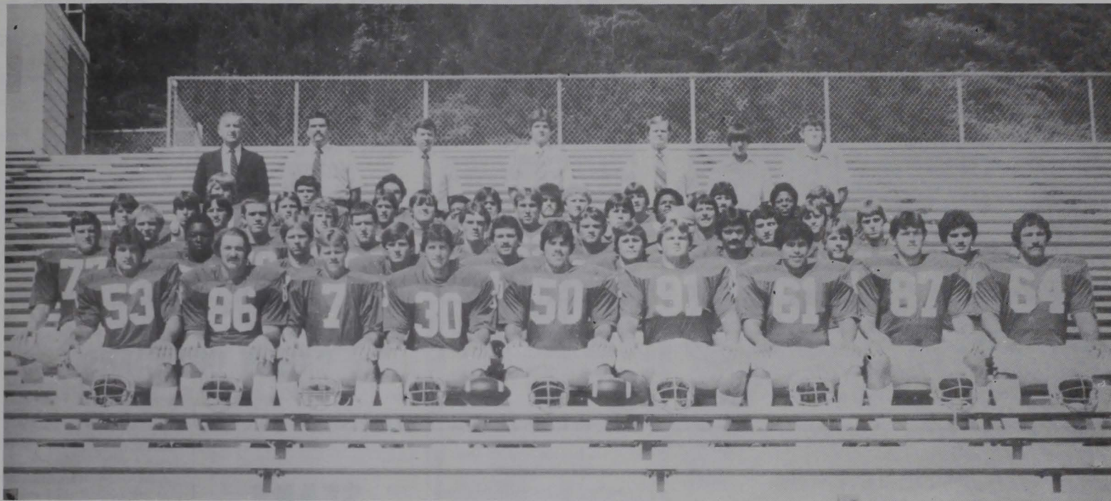
Pictured above is the 1980 GSC Pioneer Football Team.