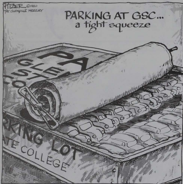
PARKING AT GSC... a tight squeeze