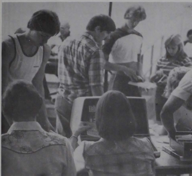
Students paying fees to begin the Fall '80 semester.