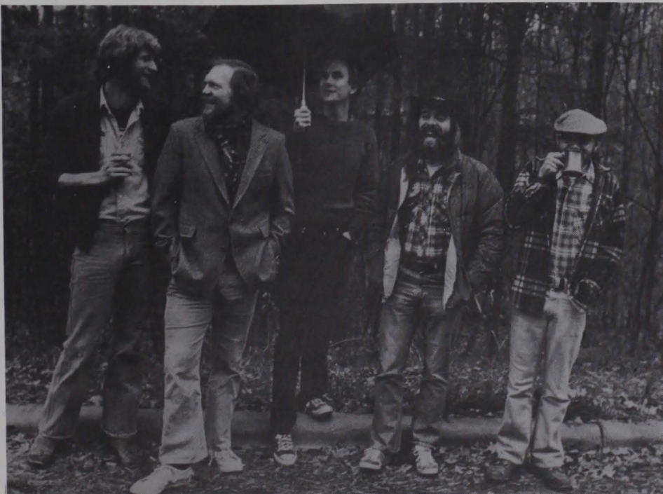
The Red Clay Ramblers will be performing at the GSC Field Day on April 23. The Ramblers travel the world over playing bluegrass, country, and jazz music. The group is originally from North Carolina.

This program and a similar concert ("Tonight: Franz Liszt") have received magnificent reviews at colleges and universities throughout the United States and Europe. The concert is free, open to the public, and sponsored by the Cultural Affairs Committee.