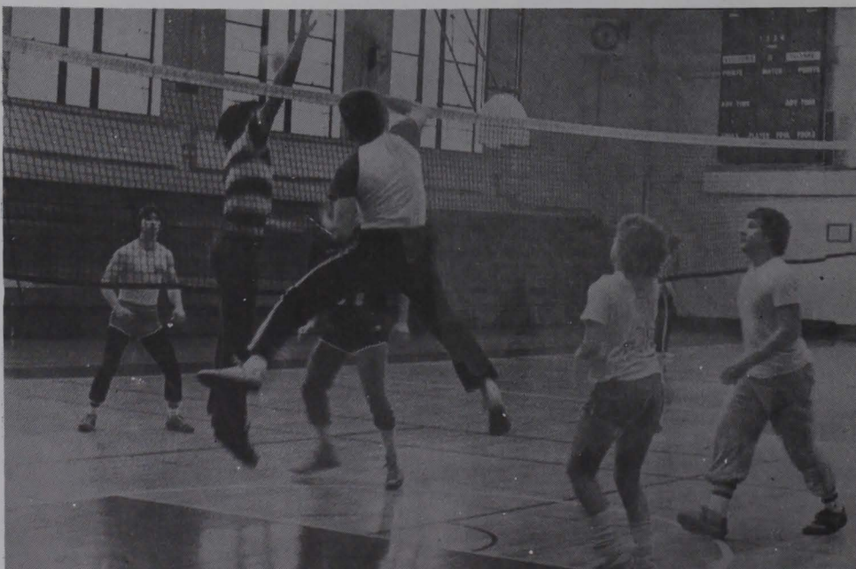
Many teams participated in the MD volleyball tournament held on Wednesday night. Shown above is the Spikers of the Chemistry Society and the Foresters. The Spikers were the overall winners of the event.