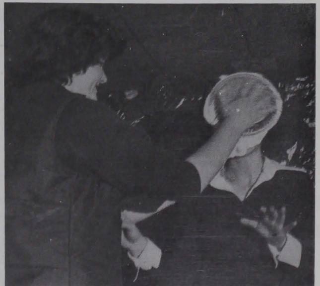
MD Week started off with a bang as is shown with the above picture of the pie throwing contest.