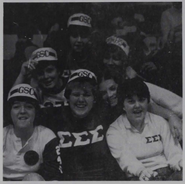
Many fans attending the GSC home basketball games have been seen wearing the new Pioneer Spirit Caps. The caps may be obtained for $1 at the Office of Student Affairs or at any home ballgame and are sponsored by Student Congress-