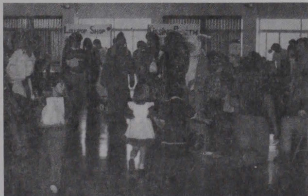
The President's Christmas party featured a carnival of activities for the children of the College community, complete with storybook characters and Santa Claus.