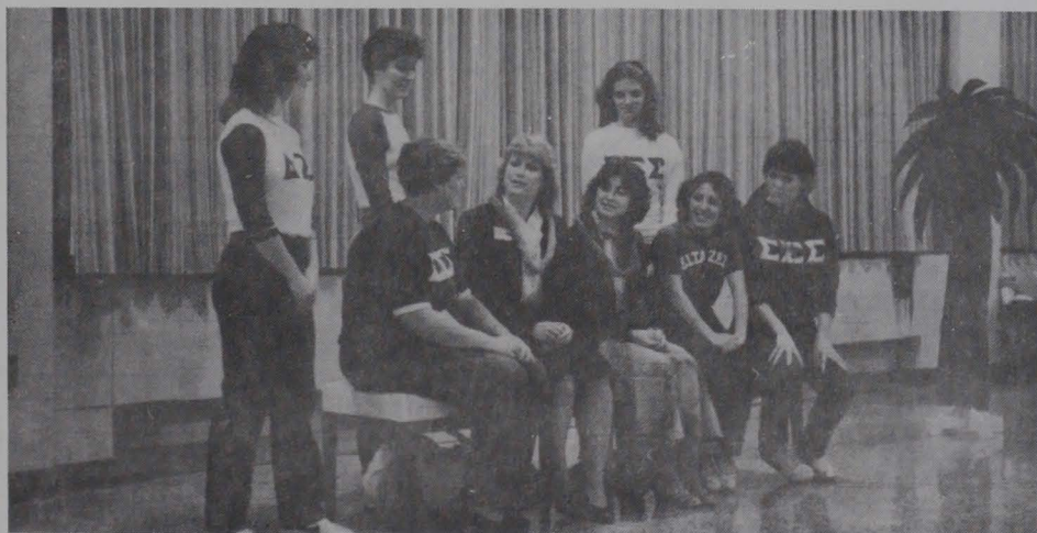
"Fantasy Island" the theme of Joint Rush, gave the sorority's a chance to show potential pledges the meaning of sisterhood.