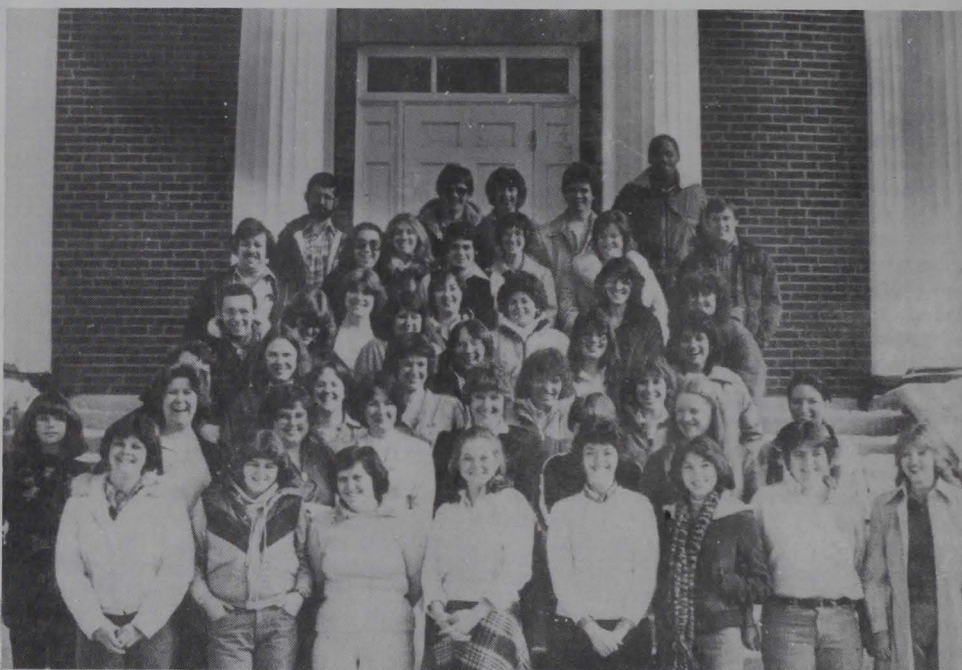
Pictured above are the spring Student Teachers who are now preparing for a semester of teaching in the school systems. The student teachers will be leaving next Friday, February 12, 1982.