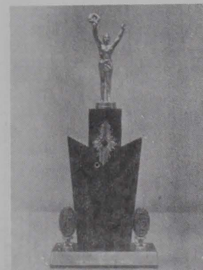
GSC's Reader's Theatre team received the first place trophy in its category after competing against 26 other schools.

February 12, 13 are the date of the next tournament, which will be held at Ohio University.