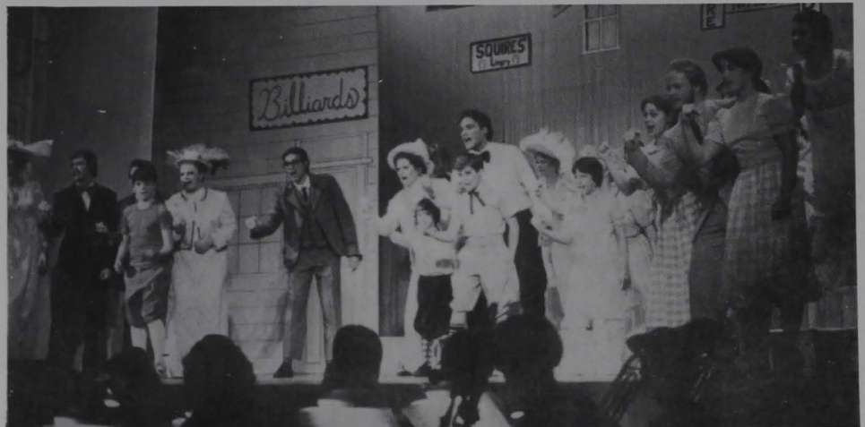
Members of the cast, orchestra and crews of THE MUSIC MAN have been anxiously preparing for the spring drama production to be presented March 5-7 in the GSC Auditorium.

She said, "I really enjoy speaking to people who are interested in poetry, and I enjoyed speaking here."