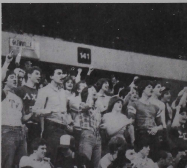
Many Pioneer fans traveled to Charleston to encourage the Glenville team during tournament action.