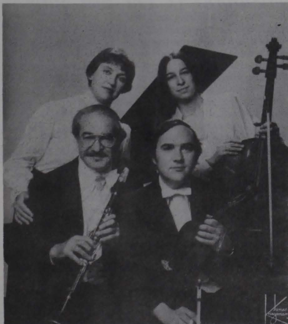
The Berkshire Chamber Players