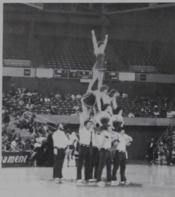
The GSC cheerleaders are shown as they performed at the Civic Center during tournaments.