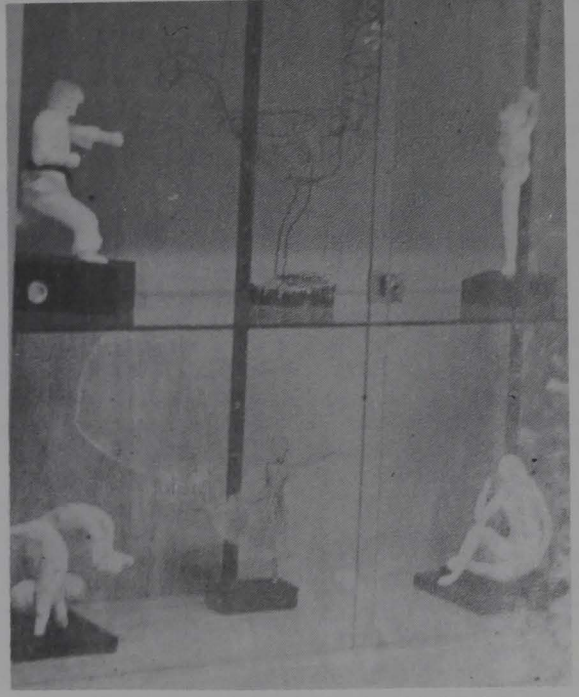
Sculptures are displayed outside the auditorium

All men participating in intramural basketball are reminded to check the schedule in the PE building, as games are now being played.