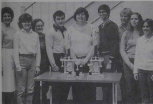
The Forensics team displays trophies won at the WV State Tournament where they were selected grand champions.