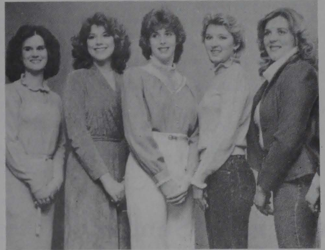
One of these five girls will be chosen as the 1982 Miss Glenville State College at tonight's pageant.