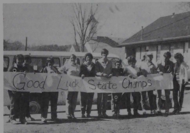
Members of the GSC State Champion Forensics Team departed for the National Forensics tournament at Ohio State on April 21.