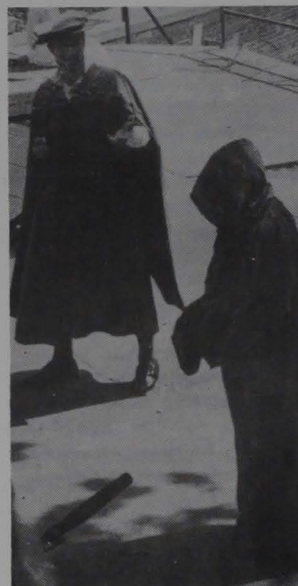
Everyman receives orders from Death.