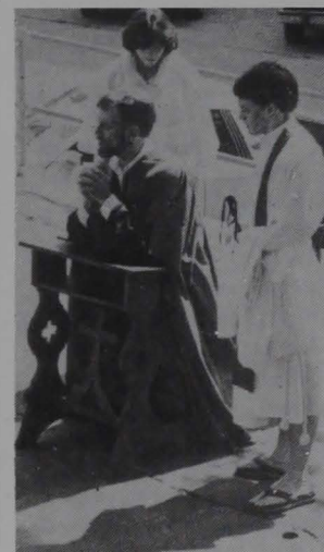
Everyman at Confession for his misdeeds.