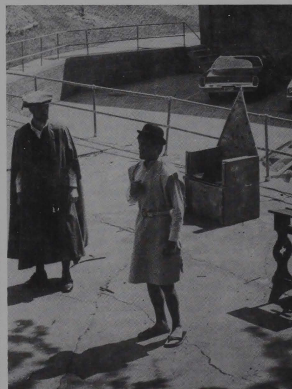
Fellowship decides that he cannot make the journey with Everyman.