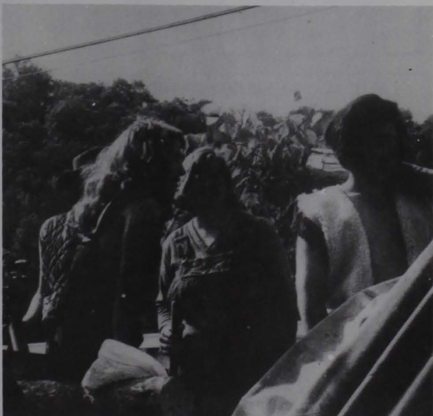
Winning first place in the float competition was the Forestry and Land Survey Departments.

This committee meets to provide the student's views and constructive criticism for the organization and operation of the cafeteria.