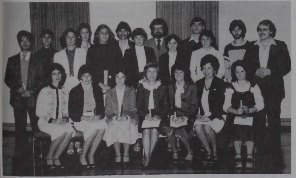
New members of the Kappa Delta Pi Education Honorary were initiated November 11, in the Wesley Foun-

Fund, The Glenville Business Organization and Glenville State College will be placing donation canisters in busi-nesses throughout Glenville. Your generosity and support for Glenville will be greatly appreciated by the steering committee for the "Have Yourself A Merry Little Christmas" weekend.