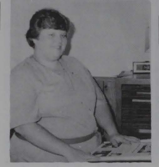
Mercurysi to see changes as the Mercury celebrates its 53rd birthday.

Marietta College. Her opera workshop per-Her opera workshop performances have included 'Adalgisa in Norma,' 'Cherubino in Le nozzi di Fegaro,' the 'Mother in Amahl and the Night Visitors,' 'Tisbe in La Cenerentola,' 'Prince (Continued on p. 4)