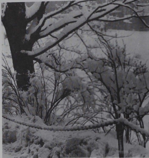
Trees and chain fences were covered with several inches of the snow. The snow clung to the objects due to a freezing rain late Thursday night.