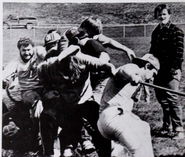
The first place tug of war team strains one-handed against their opponets.