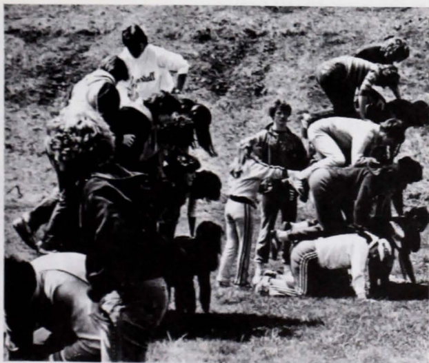
Teams compete in the pyramid building contest at the annual GSC Week Field Day.

Students are reminded to pre-register for the fall term by Friday