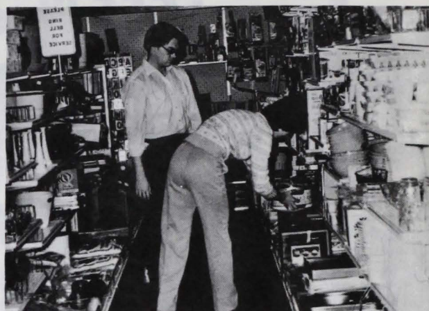
Members of the Marketing 478 class received practical experience on Monday, as they ran the Ben Franklin Store in downtown Glenville.