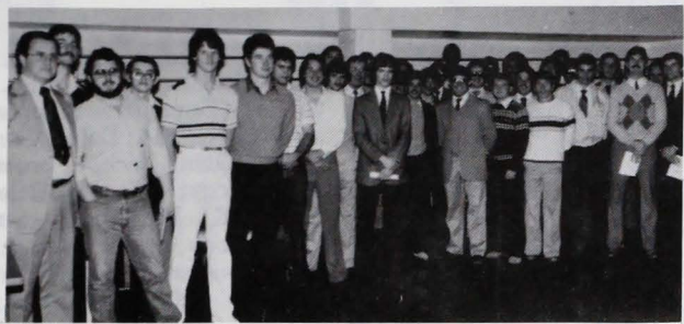
Pictured above are the participants in the Outstanding Men's Banquet held April 20. It was sponsored by the Interfraternity Council.