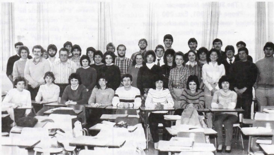
Pictured above are the GSC students currently involved in their professional semester in secondary education who plan to begin their student teaching on Monday, February 13.