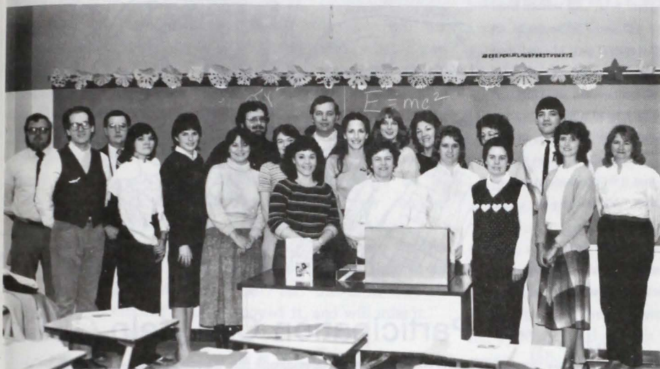
Pictured here are those Glenville State College students who are currently in their professional semester in elementary education. These students will depart from the GSC classrooms on Monday, February 13 to take over their own classrooms.