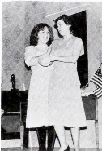
"...We were just having a delightful talk about love and marriage."