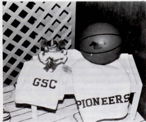
Pictured is a part of the current display in the window of the Campus Co-op.

Those interested are reminded that Bible study is held on Thursdays at 8:30 p.m. in the Wesley Foundation.