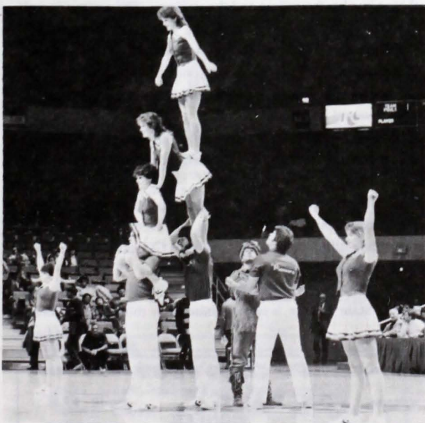
Pictured are the GSC cheerleaders at the WVIAC tournament in Charleston last week.

Before you leave the residence hall for the break, please be sure that: 1. you have unplugged everything in your room (clocks, stereos, etc.) 2. you have turned out all lights. 3. Your curtains and windows are closed. 4. Your door is locked (and windows, also.)