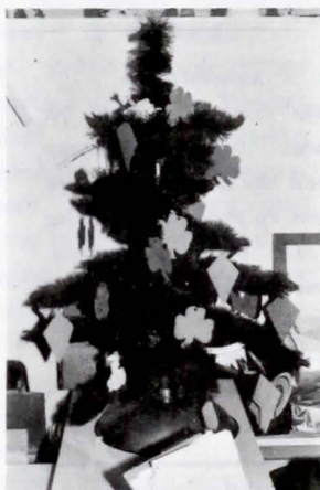
The Mercury tree.