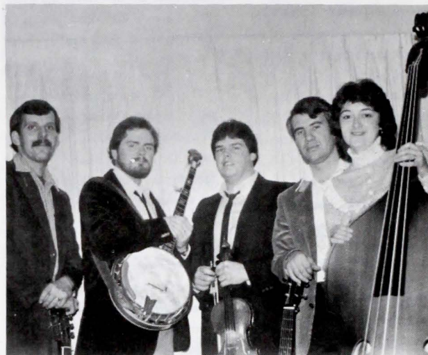
Pictured is One Way Track, a bluegrass group which will perform during GSC Week.

The MERCURY staff feels that it has stumbled onto a new trend in interior decor and invites the campus to come and view our "Un-Christmas tree."