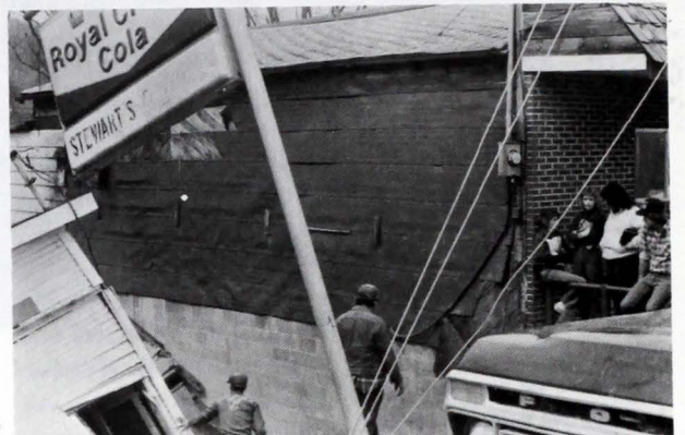
Bystanders look on as Stewart's Place (better known as Al's) finally ends up sliding over the bank toward the Little Kanawha River. Crews worked Monday to salvage what they could from the debris.