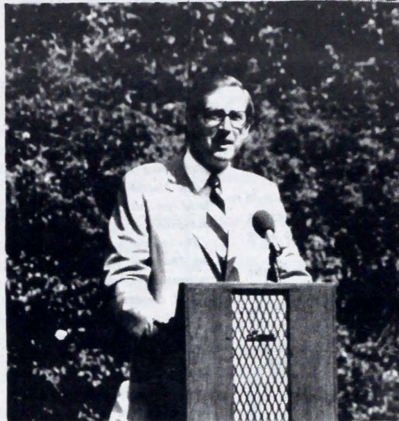
Governor Rockefeller was one of the dignitaries that spoke at the dedication of a shooting range on Sycamore Run Road.

The range will be open for use by college students and personnel as well as to the general public when policy is finalized. The range includes areas for practice, instruction and possible competition of archery, rifle and pistol shooting events.