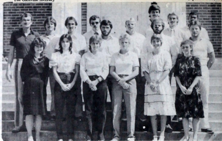
Pictured are the secondary education teachers who will begin next week.

The Sigma Sigma Sigma sorority will be selling candy for $.40 the remainder of the week. If interested contact any Sigma sister.