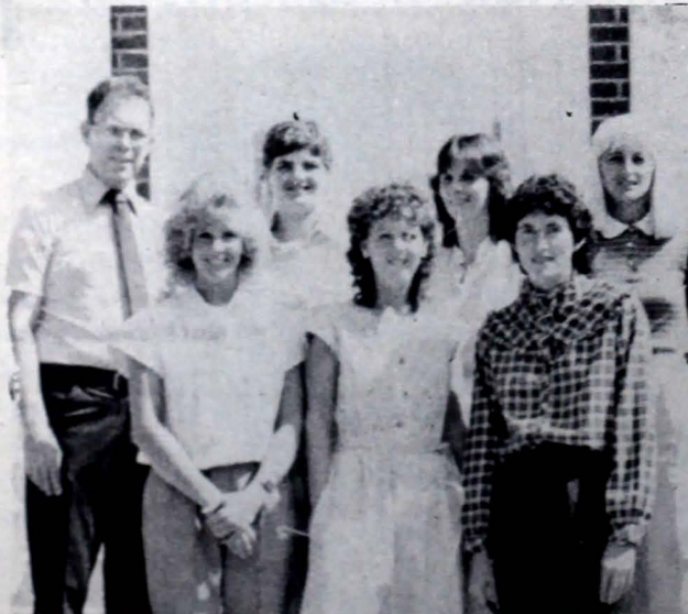
Pictured are the elementary education student teachers who will begin next week.