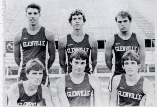
Members of the 1984 Pioneer Cross Country Team