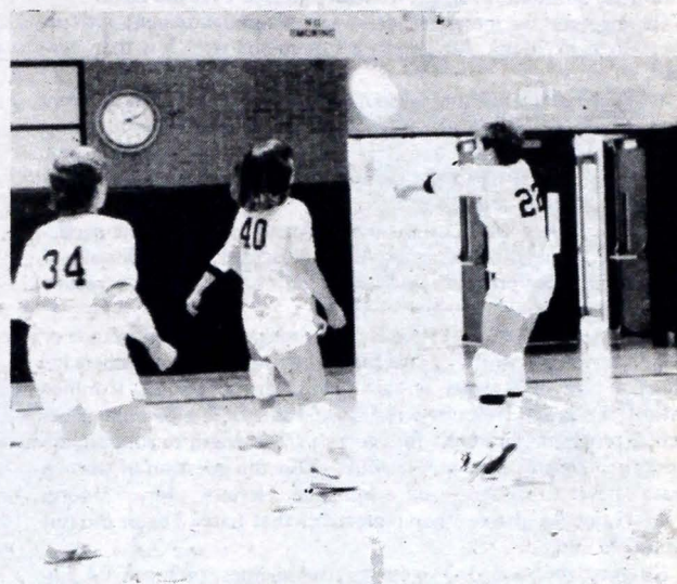
Members of the GSC volleyball team compete in the Concord Invitational.