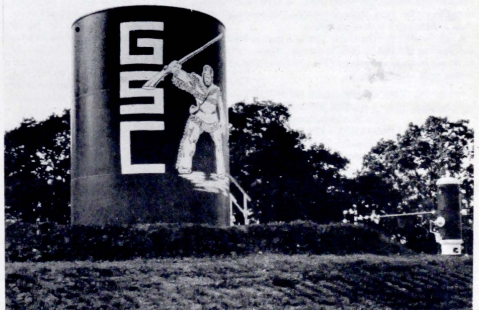
Above is GSC's own gas well that is being dedicated today at 3 p.m. at the site. A banquet will be held at 6 p.m. in the ballroom.