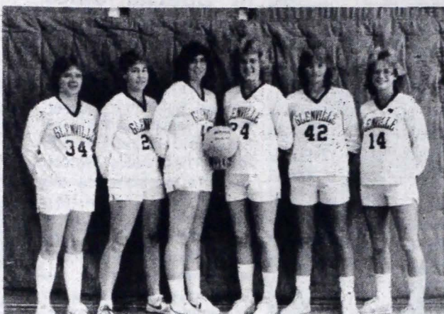
Members of the 1984 Glenville State College Volleyball Team.