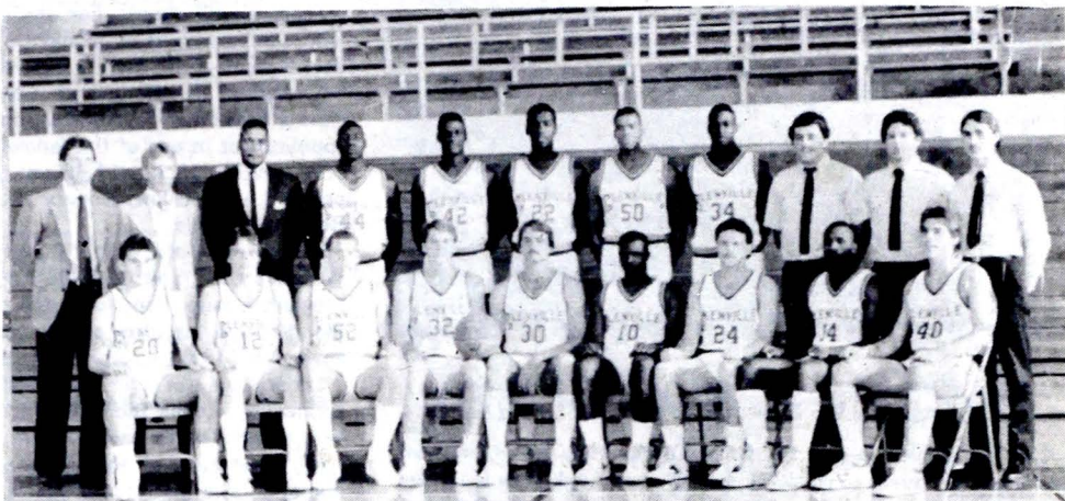
The 1984-85 edition of the GSC Pioneers will host the Sportsmen's Club in an exhibition game next week.