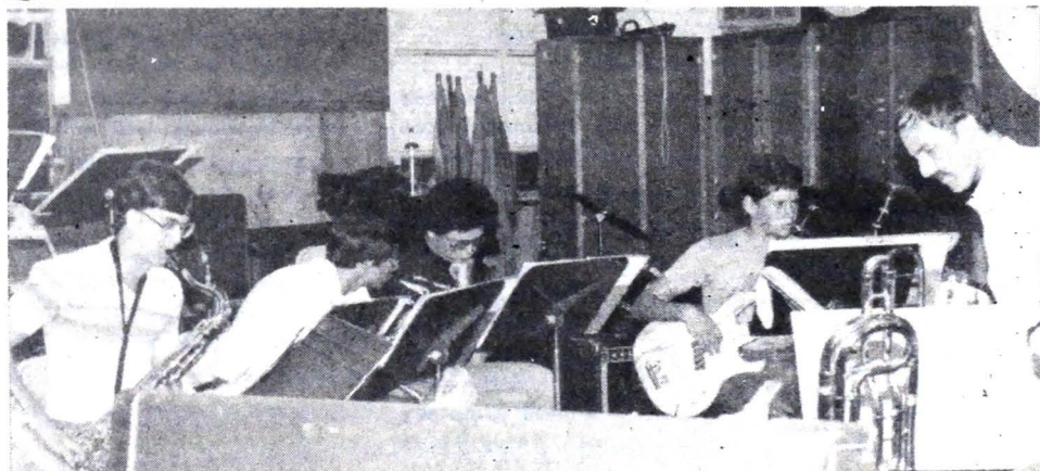
The GSC Jazz Band prepares for their upcoming concert Thursday.