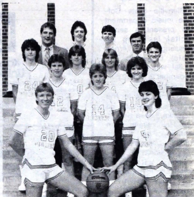
The 1984-85 edition of the Lady Pioneers will open its season Friday.