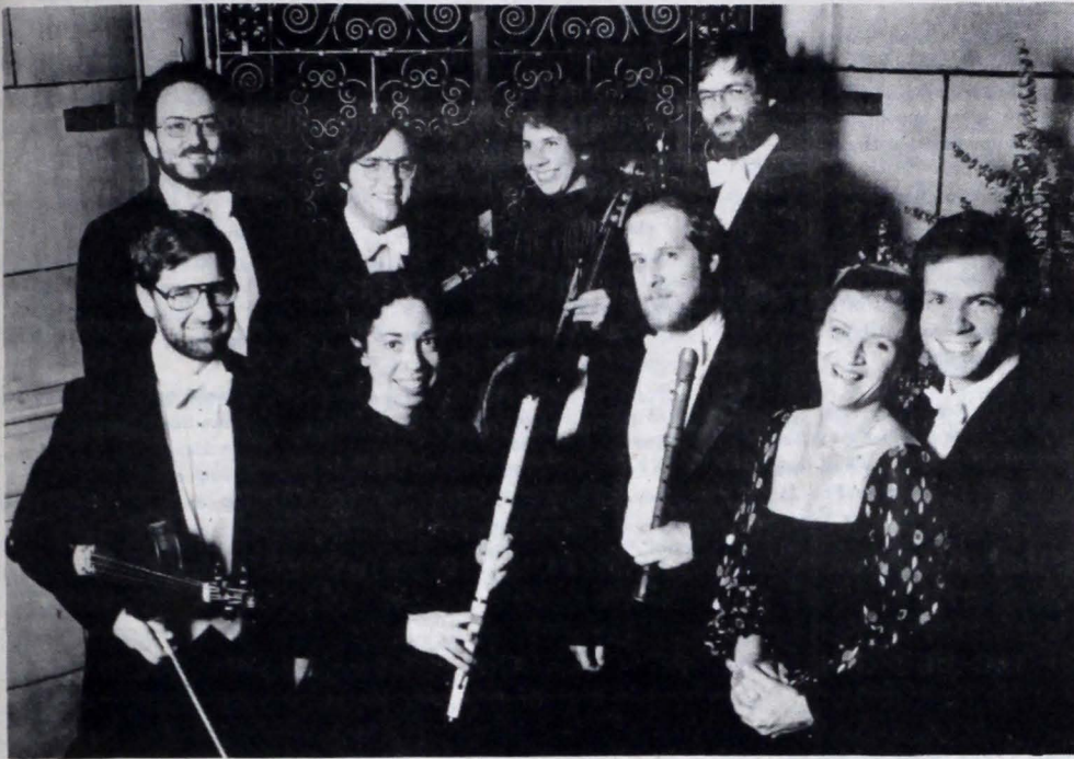
The Concert Royal will perform at 8:00 p.m. on March 7 in the auditorium of GSC. The group will present "BACHanalia."