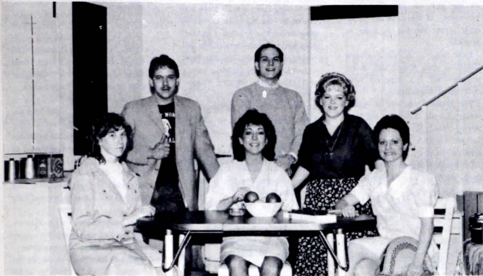
Shown above are members of the cast