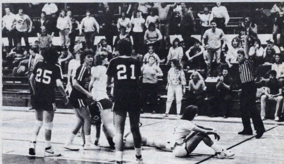
The Glenville crowd obviously disagreed with this call.