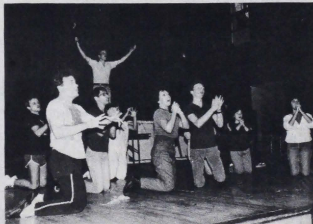
"Godspell" opens this week with performances on Fri., Feb. 21 and Sat., Feb. 22 at 8:00 p.m. There will also be a Sunday matinee at 2:00. Let's all go see this spell-binding show!!

These wells in turn create jobs for Gilmer County, providing a trade-off with Consolidated of Clarksburg on GSC's energy expenses.