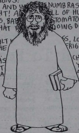
IMAGINE IT... THE HONORABLE SUPREME COURT JUDGE GINSBERG.