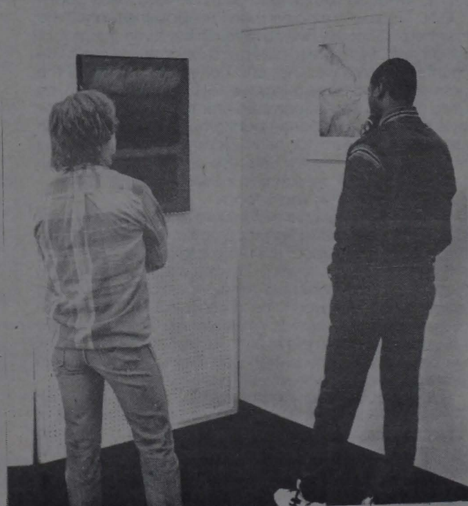
GSC students gaze at the displays at last week's Alpha Rho Tau Art Show.

To obtain registration information, call toll free 1-800-328-5111, extension 1581. Entries must be postmarked no later than March 18.